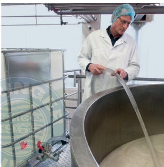
Pumping upward into a mixing container from the IBC outlet.