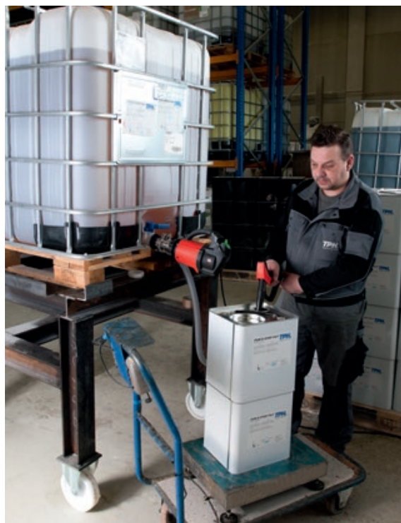
Fast container filling from the IBC outlet.