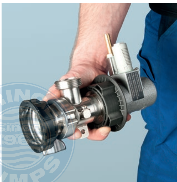
Extremely compact and light.