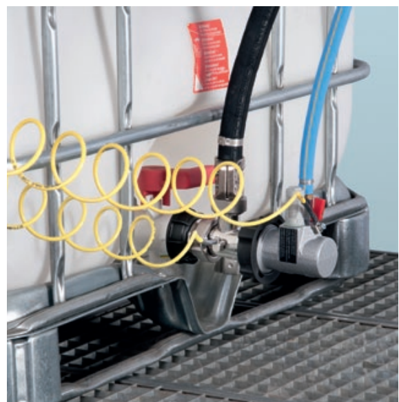
Also suitable for use in explosion hazard areas of zone 1.**