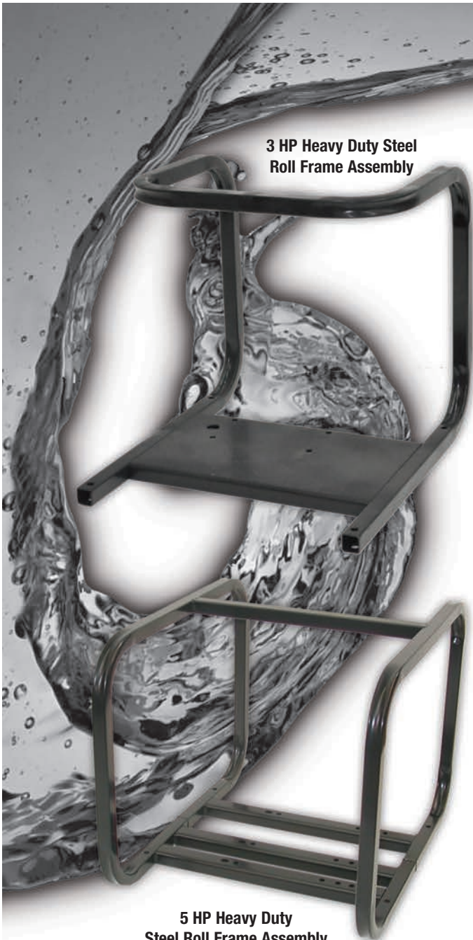
5 HP Heavy Duty Steel Roll Frame Assembly